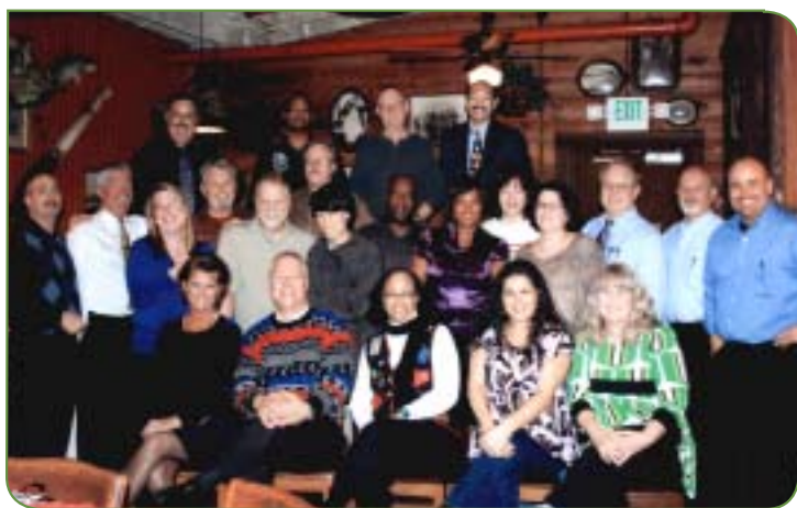
Cemetery and Funeral Bureau staff members attended the December 2008 Holiday Party at Monterey Bay Cannery.

These are just a few examples of ways that your funeral home can lead your community to an understanding that the death care industry wants to be known as much for its caring as for the funeral services it provides.